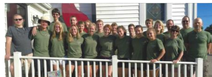
2016 R.I.S.E. TEAM

As you consider your pledge to the 2016 Bishop's Annual Appeal, it is important to know that the Partners in Faith campaign conducted in 2013 and the Bishop's Annual Appeal are different drives serving different needs. The Partners in Faith campaign raised funds for ministries outside the Diocese's general operating funds and included some endowments with an eye toward future needs. The bishop's Annual Appeal, on the other hand, helps fund immediate day-to-day operations of four important ministries and programs: Catholic charities, seminarian education, our diocesan priests' retirement residence and our inner-city schools. With this in mind please be as generous as possible to this year's Bishop's Annual Appeal. If you have received the Bishop's letter, please prayerfully respond today.